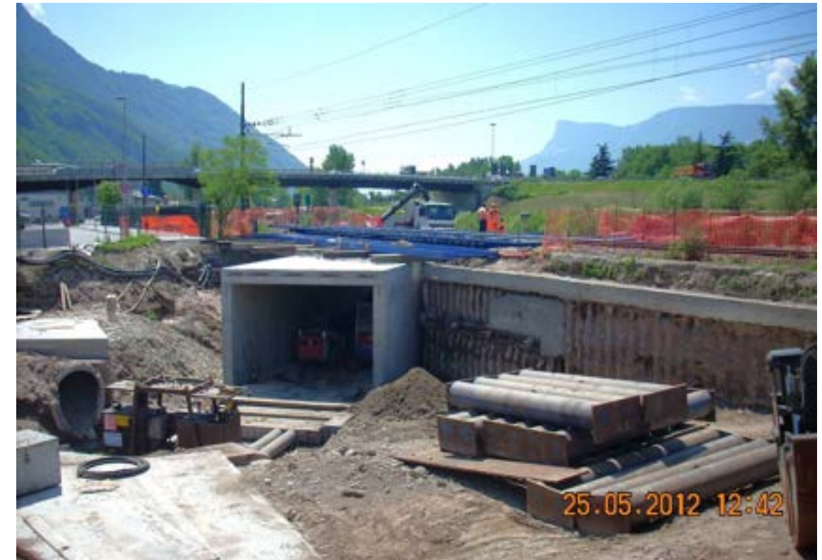
Figure 3 - Box Jacking