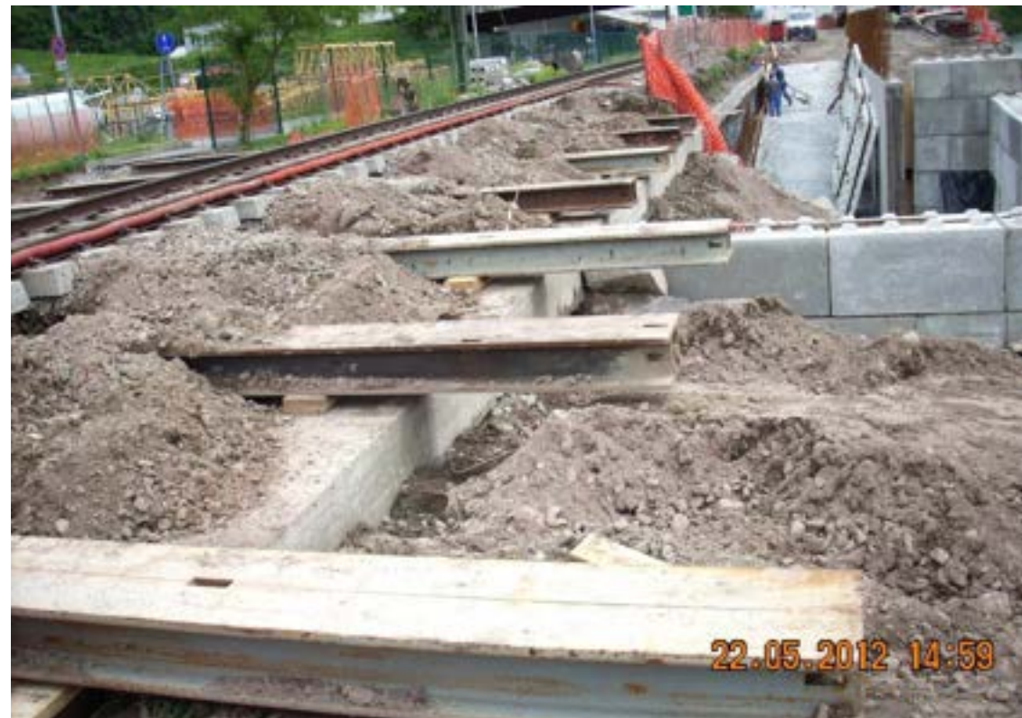
Figure 6 - Transverse beams