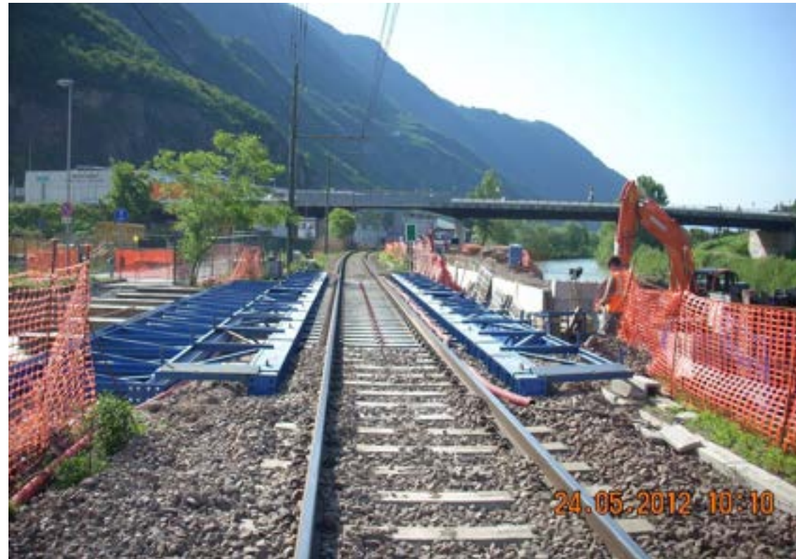
Figure 2 - Verona System installed on tracks