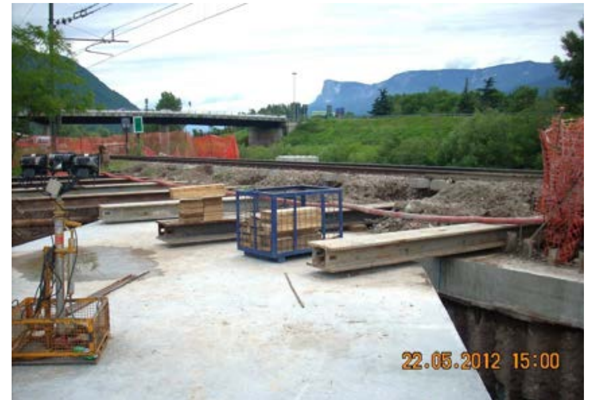
Figure 7 - Transverse beams