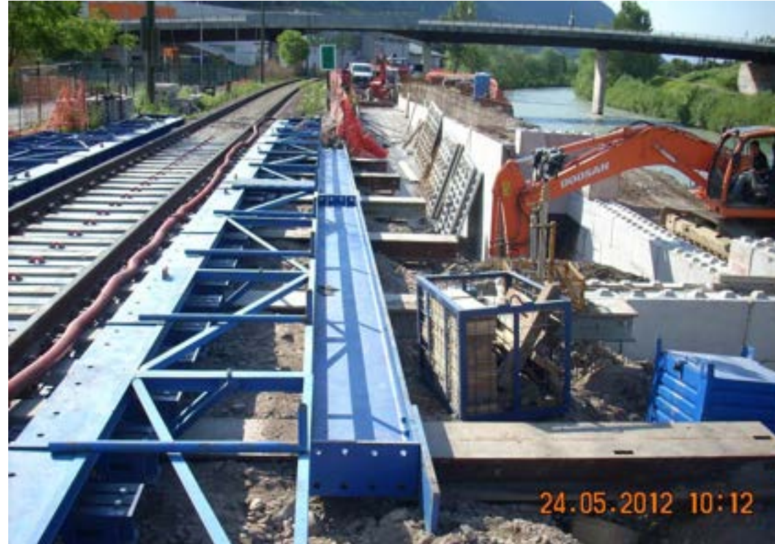
Figure 4 - Verona System