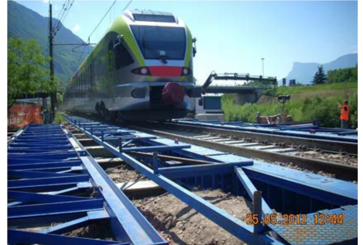
Figure 5 - Active train traffic on Verona System installed