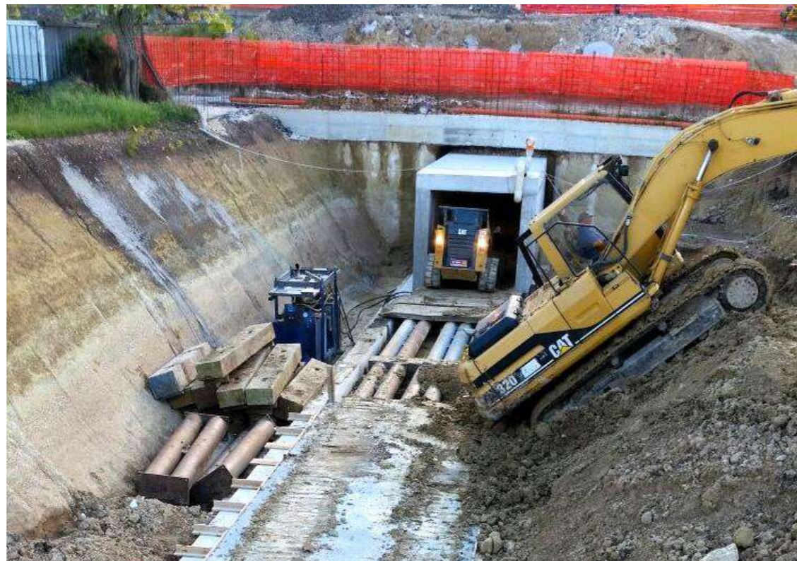
Figure 7 - Box Jacking