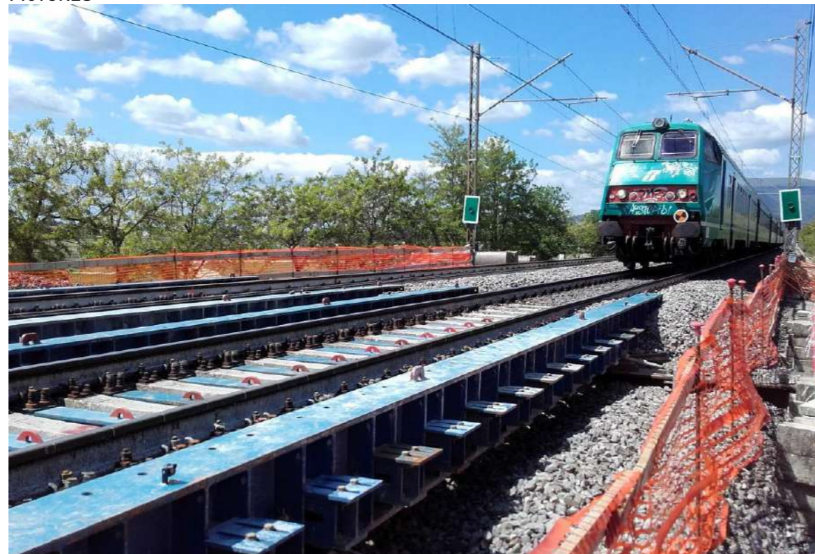
Figure 3 - Verona System installed on tracks with active train traffic circulation