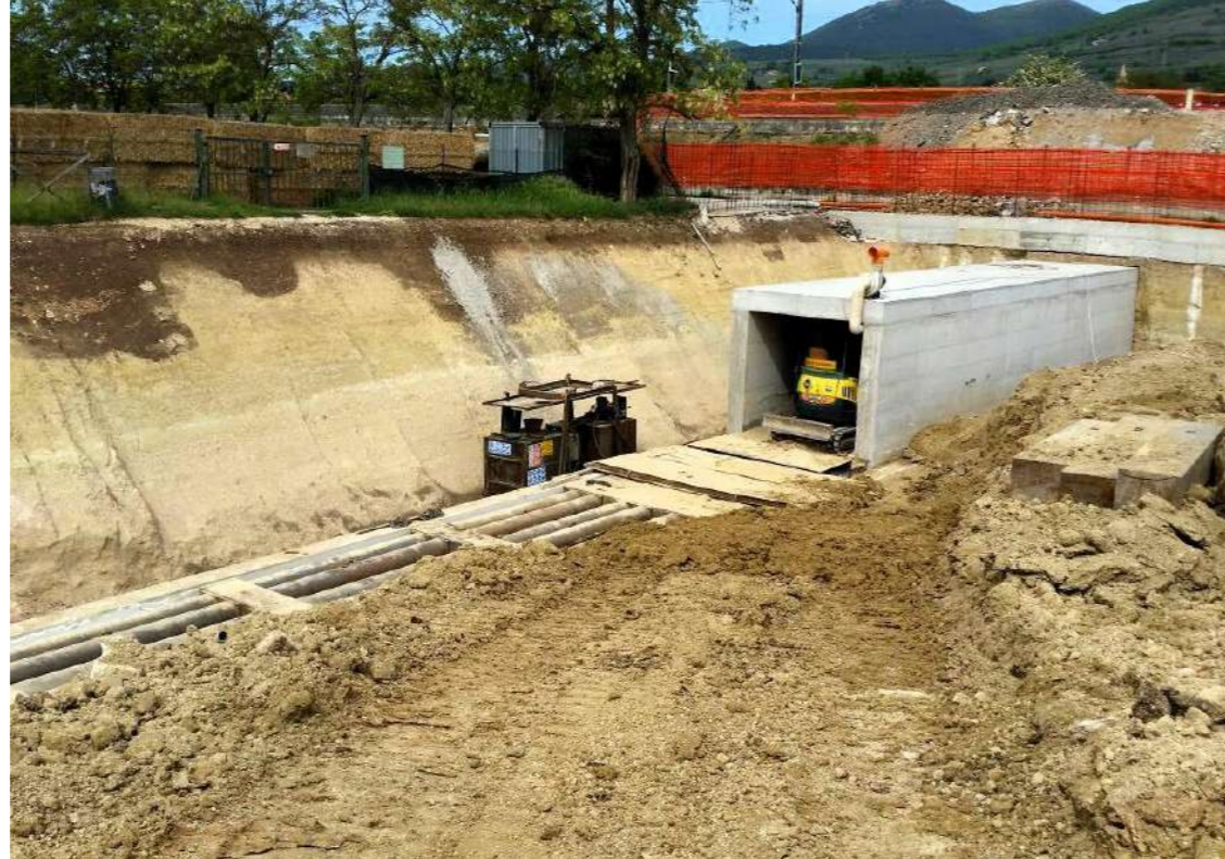
Figure 5 - Box jacking with hydraulic jacks, spacers and power packs