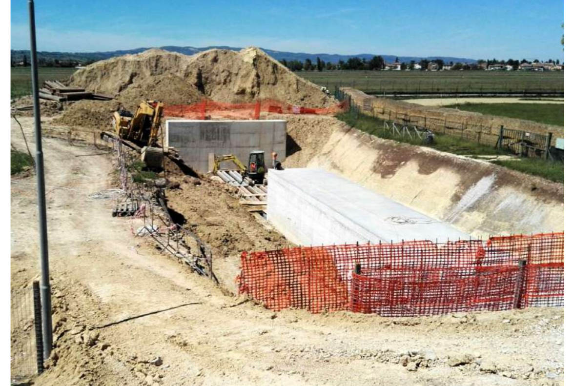
Figure 6 - Jacking wall and jacking column