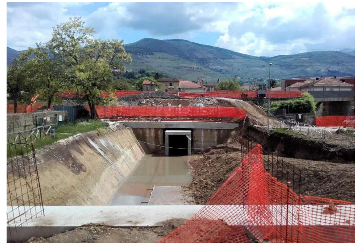
Figure 8 - End of Box Jacking