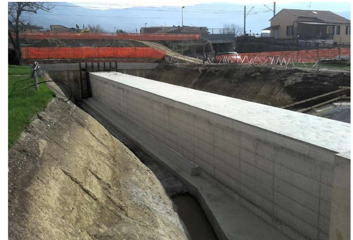
Figure 4 - Box before jacking