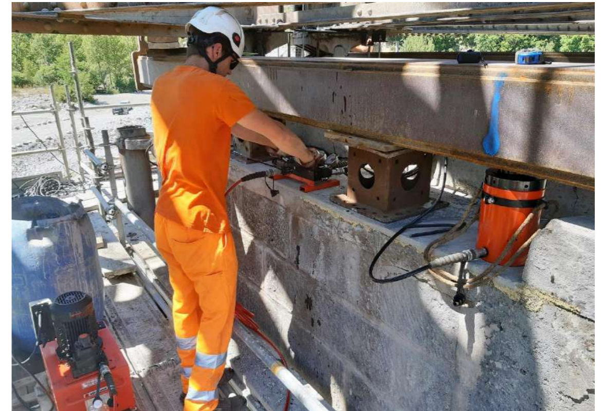
Figure 4 - Bridge jacking with jacking system