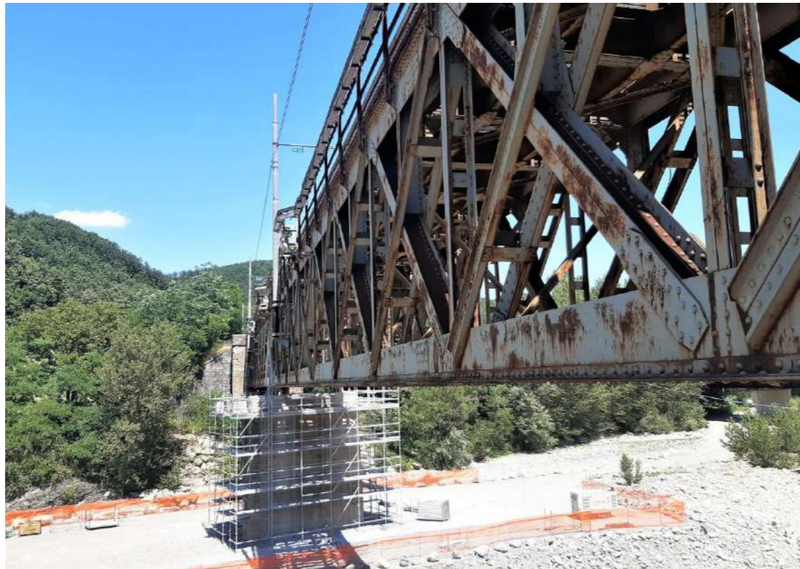
Figure 3 - Bridge Jacking