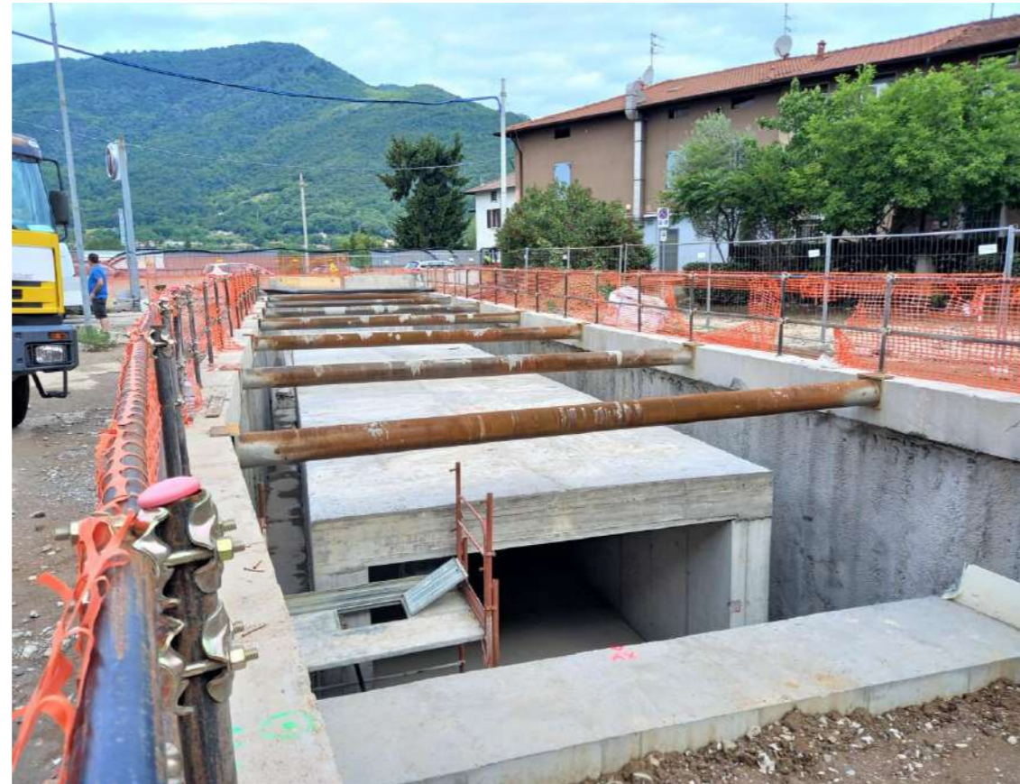
Figure 2 - Open pit Box Jacking