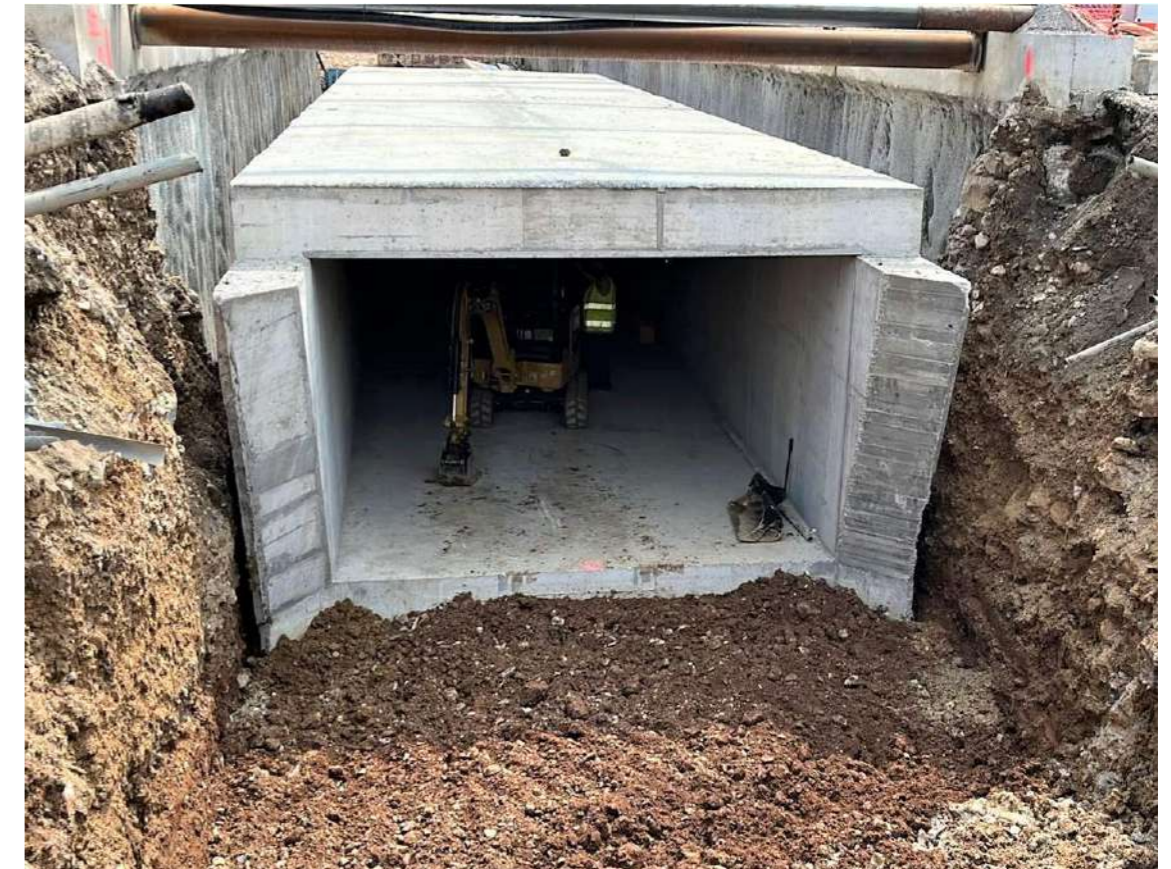
Figure 3 - Open pit Box Jacking