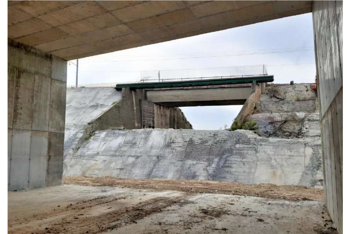
Figure 6 - Front view from inside the box