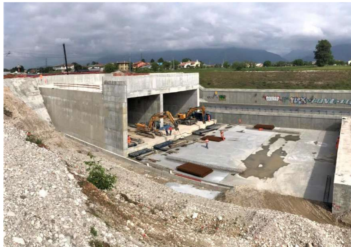
Figure 7- Box Jacking with traffic shutdown