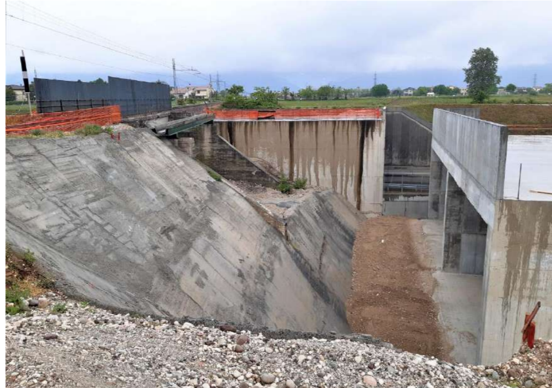
Figure 5- Front view of the box