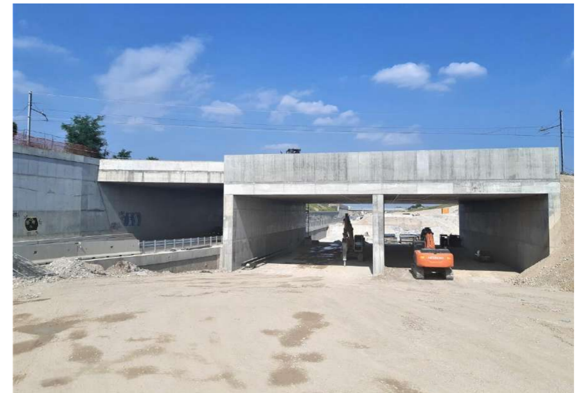
Figure 8 - View of the jacked box