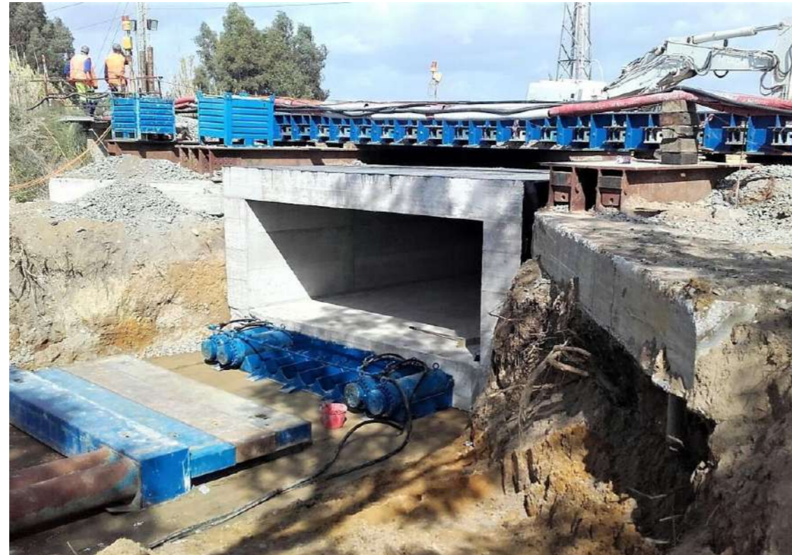
Figure 3 - Box under Verona System