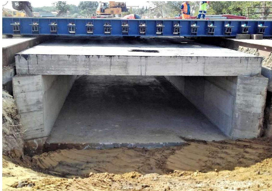
Figure 7 – Box pushed under Verona System