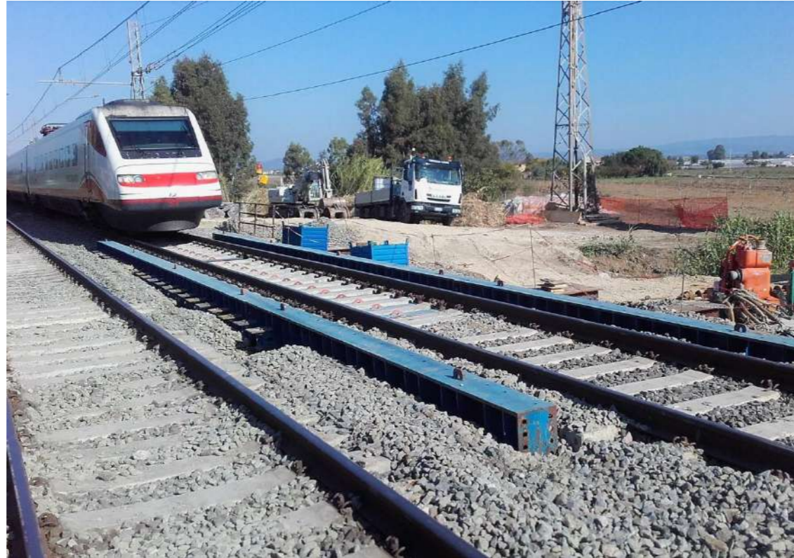
Figure 5 – Active traffic and temporary bridges installed on track