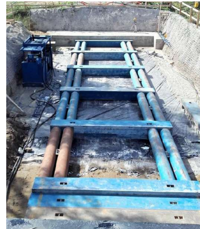
Figure 8 – Jacking System