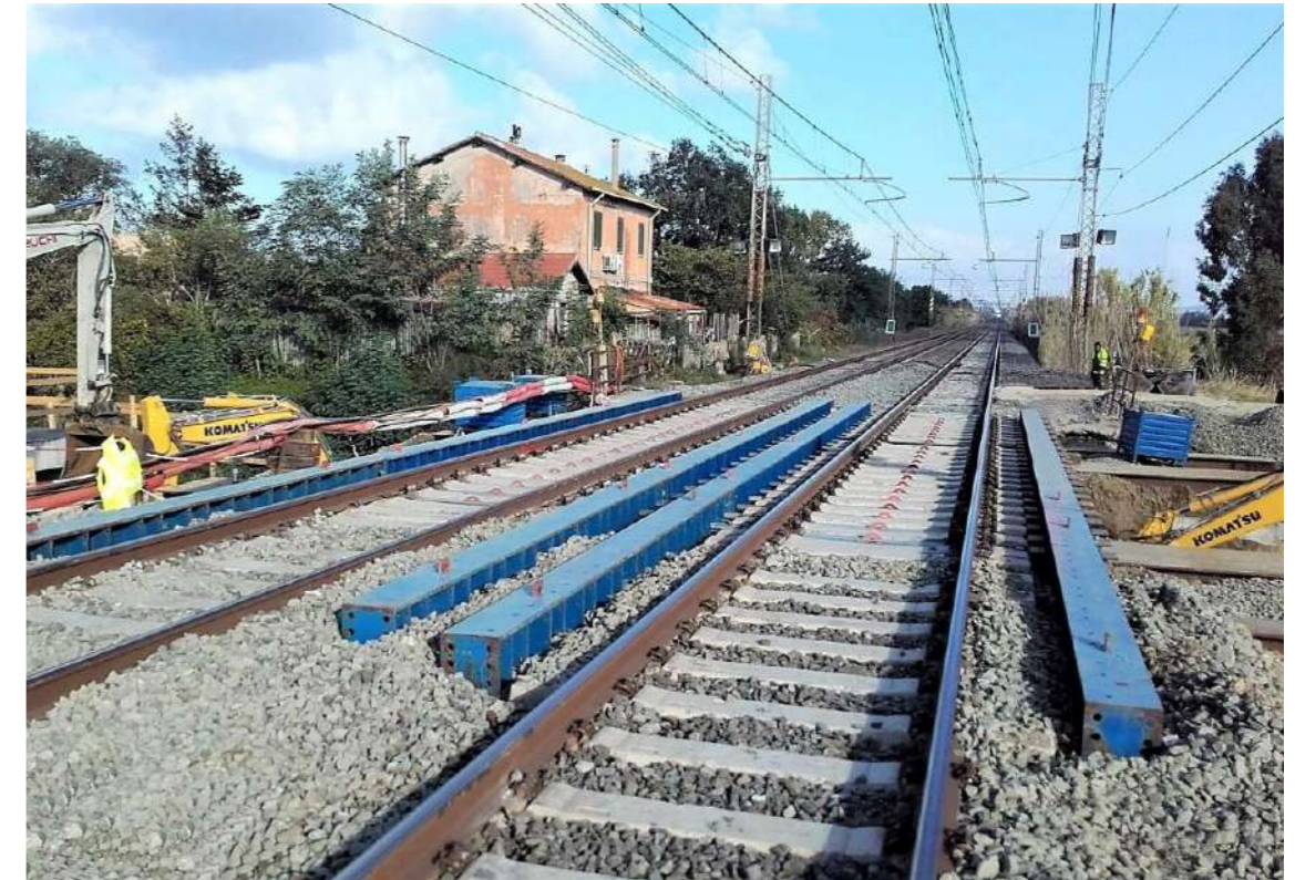
Figure 4 - Temporary bridges - Verona System