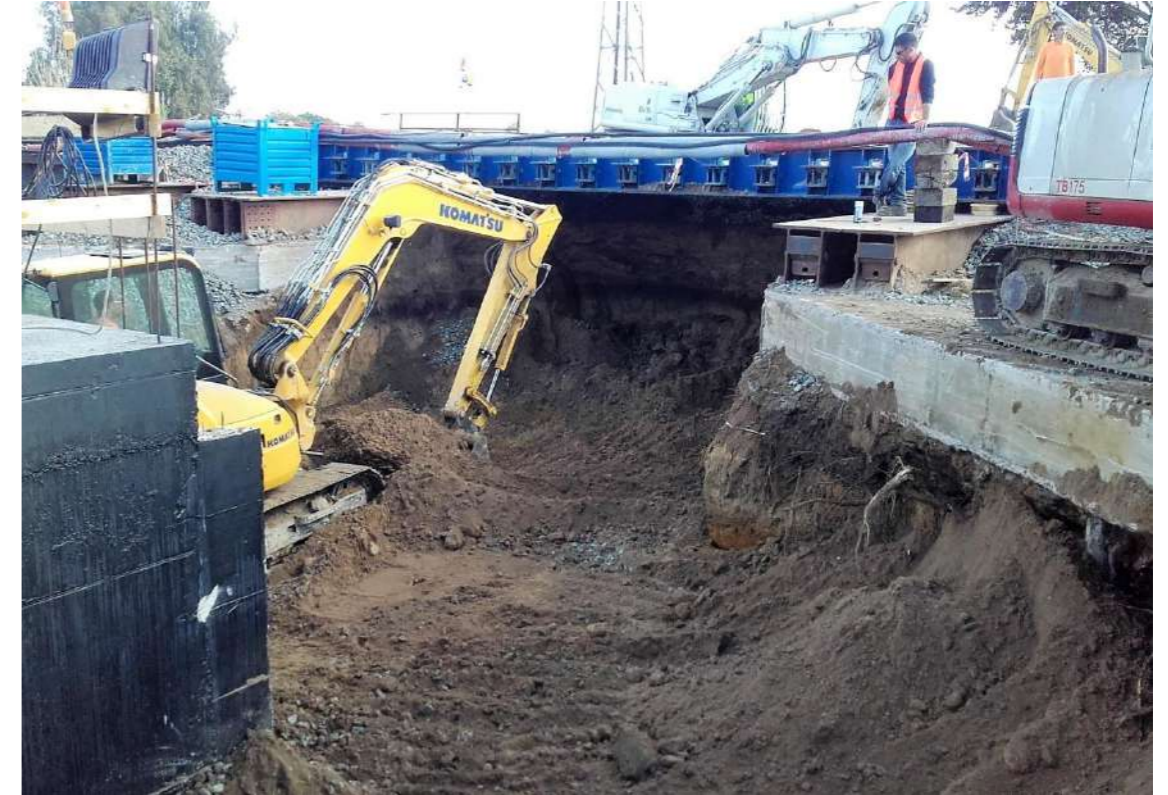
Figure 6 – Temporary bridges installed and excavation